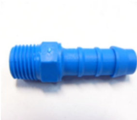
P3N NYLON HOSE TAIL