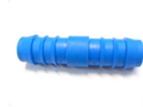
P7N NYLON HOSE JOINER