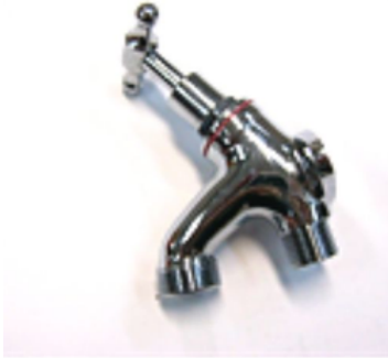
TH-58C 1/2 CHROME LUGGED BACK PLATE