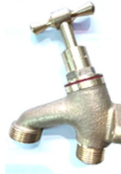
GT-08L 1/2 BRASS LUGGED BACK PLATE