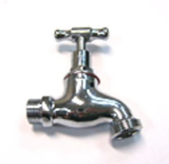
106200 1/2 MALE HOSE BIB CHROME PLATE