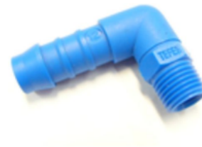
P6N NYLON HOSE MALE ELBOW