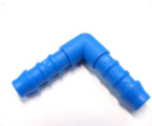
P11N NYLON HOSE ELBOW