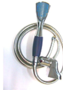
HSWRASSY DIAMOND HEAD HAND HELD SHOWER